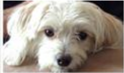
Miss Muffin. our "Missy"

“ 2 files added to the album Memories Album